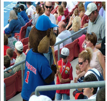
A Cubbie meets a Sparky at the Iowa Cubs Game.

This will make the ?? year we have done this.