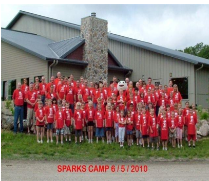
SPARKS CAMP 6 / 5 / 2010

2010 marked the 12th year of Iowa Sparks Camp-A-Rama.